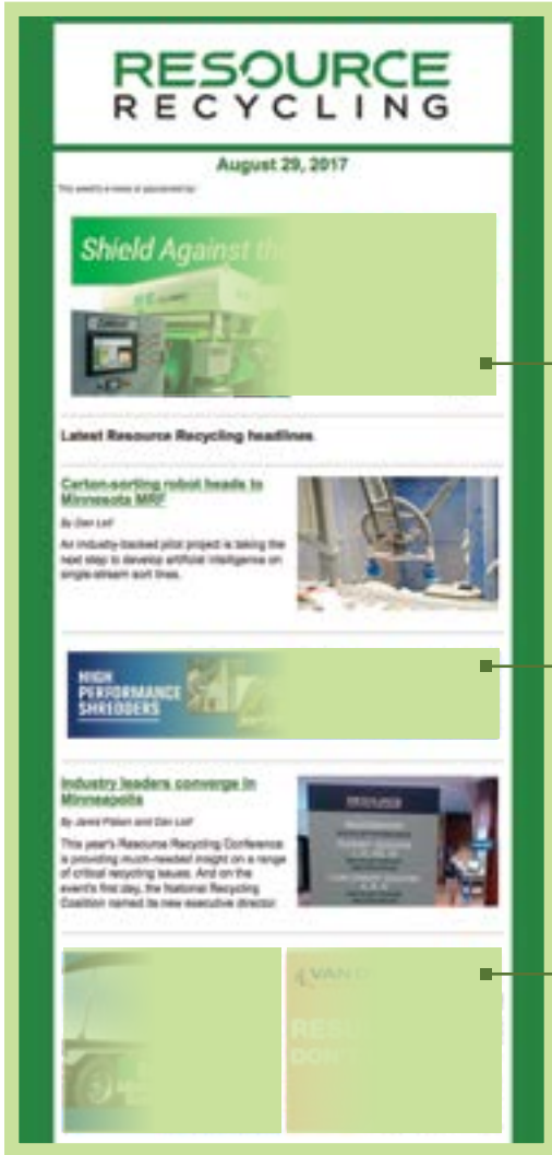
TOP BANNER 600 pixels x 120 pixels