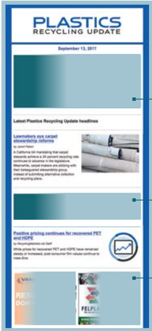
TOP BANNER 600 pixels x 120 pixels