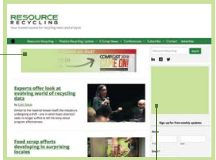
TOP BANNER 600 pixels x 120 pixels