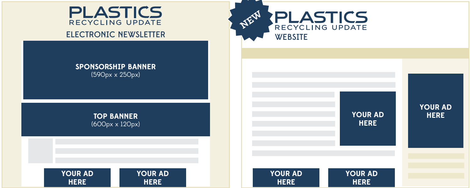
(The mock-ups above show just some of the digital advertising possibilities potentially available.)