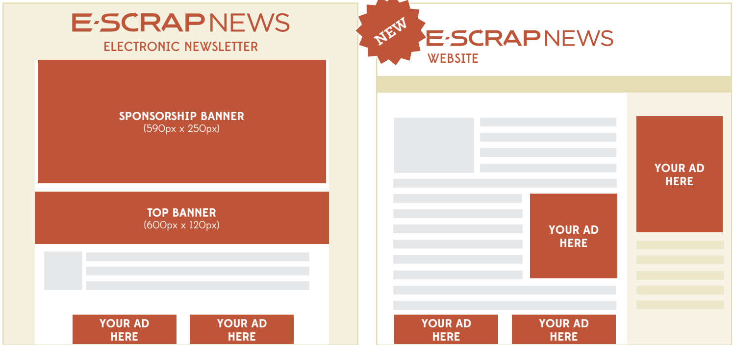
(The mock-ups above show just some of the digital advertising possibilities potentially available.)