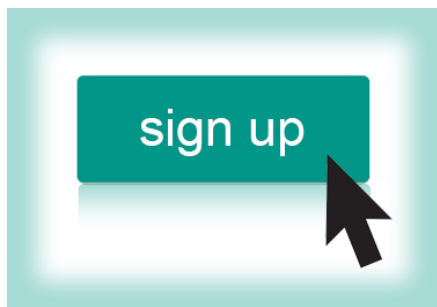
Steps 1: Sign up for Service

Sustainability managers can subscribe to the Green Tracking Service to assist them to proactively and securely monitor their recycling chains to ensure proper e-waste recycling that protects their brand reputation. GTS uses state of the art recyclable sensors, a secure cloud Internet of Things (IoT) platform with Machine Learning capabilities to provide visualization of real-time analysis, at-a-glance, that can be viewed with any online device.